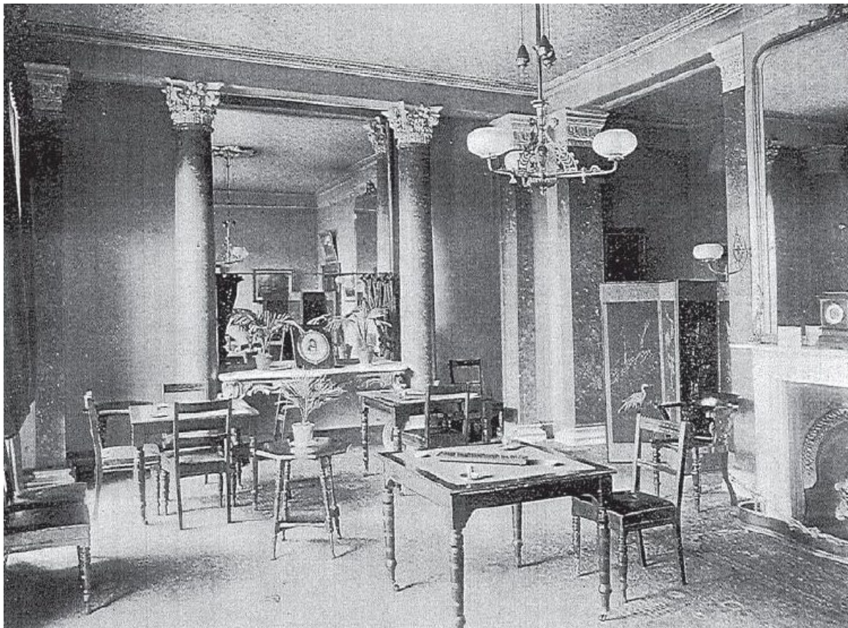
Circa 1896