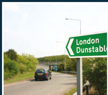
Immediate access to A5

For further information or to arrange a viewing, please call: