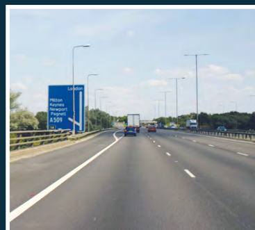
5 mins to M1 (J14)