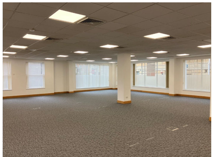
Example photo of the ground floor