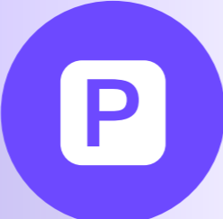
15 car parking spaces