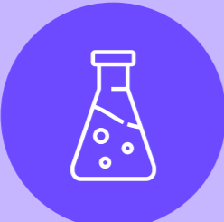
Fitted CL2 lab accommodation