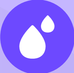
CAT 5 water installation