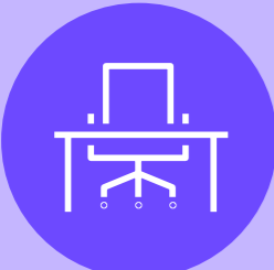
Fitted office accommodation