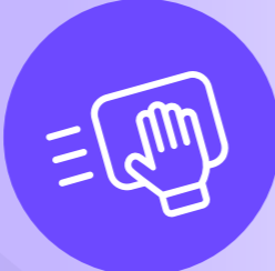
Wipeable ceiling tiles