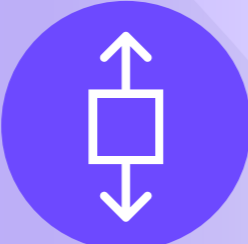
Goods & passenger lift